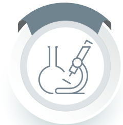
Pharmaceuticals Industrial UV