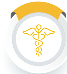
Healthcare Industrial UV