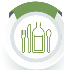
Food & Beverage Industrial UV